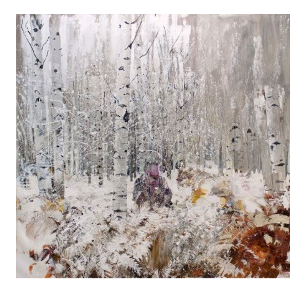
Adrian Ghenie, Persian Miniature, oil on canvas, 300 x 290 cm, 2013, © Adrian Ghenie, Courtesy of Private Collection

Ghenie is best known for his dramatic portrayals and moody as well as gloomy atmospheres, but he can also depict softer and lighter tones. At the 2015 Venice Biennale, he represented the Romanian pavilion within the Giardini through the project Darwin's Room. The message and aim were to explore and investigate 20th-century history and the evolutionary theories, to show where modernity has led to in the present. The focus indeed was the artist's vision of the contemporary world. On this occasion, Persian Miniature was showcased. Exhibited by Pace Gallery too, the canvas portrays the recurrent dialogue between the intangible and emblematic. The elements here are more environmental as opposed to the interiors of much of his previous works, and there is an intense search for a balanced aesthetic. The nuances are softer and contrasts smoother. The setting is somewhat daydreamy. Still, the painting exudes a stark sense of solitude and loneliness. In paradox to its title, this was the largest canvas in the series.