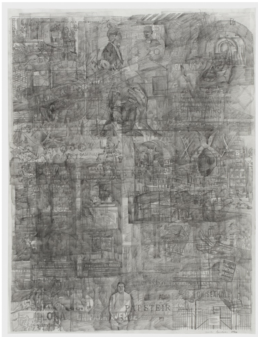
Ciprian Muresan , All Images from a December 2016 issue of ARTnews magazine , 2017, graphite on paper, 28 x 21 1/2 in.

COURTESY THE ARTIST AND DAVID NOLAN GALLERY