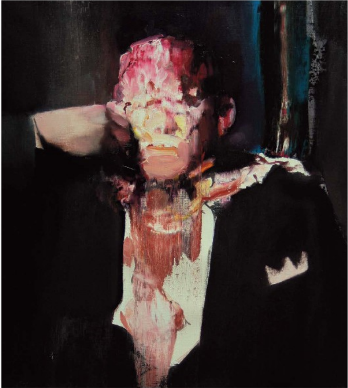
Achille Obergé, Pie Fight Study 4 , 2009. Oil on canvas, 27 1/4 x 22 1/2 in.