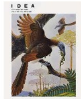
CLOCKWISE FROM TOP LEFT: Victor Manu, Untitled (detail) , 2007. Oil on canvas mounted on wood and print on acetate. Painting: 10 1/2 x 14 1/2 in., acetate: 15 1/2 x 10 1/4 in., installed dimensions variable. IDEA art + society cover, issue no. 30-31, 2008. installation view of "Berlin Show #1," Plan B, Berlin; Victor Manu, Untitled , 2007. Oil on canvas mounted on board and print on acetate. Painting: 22 1/4 x 14 1/4 in., acetate: 15 x 22 1/4 in., installed dimensions variable.