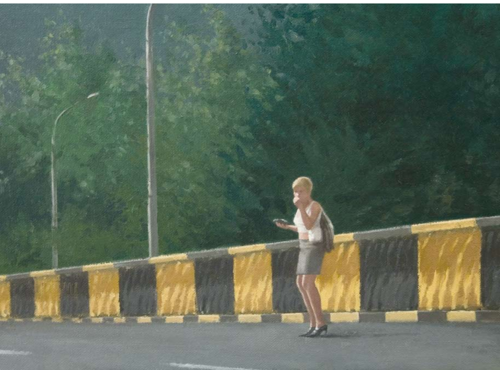
Serban Savu, Manastur Bridge 2 , 2007. Oil on canvas, 11 3/4 x 15 3/4 in.

The venture exceeded expectations. Plan B's artists are now included in the stables of some of the world's leading galleries and are regularly invited to participate in major international art events. (In fact, so successful has the gallery been in launching native artists that Ghenie has gone back to concentrating on his painting, although he is still linked to Plan B as an artist.) These international connections—and the non-Romanian collectors they attract—have been essential to the development of the country's contemporary art arena, as relatively few Romanians are willing to personally support emerging art.