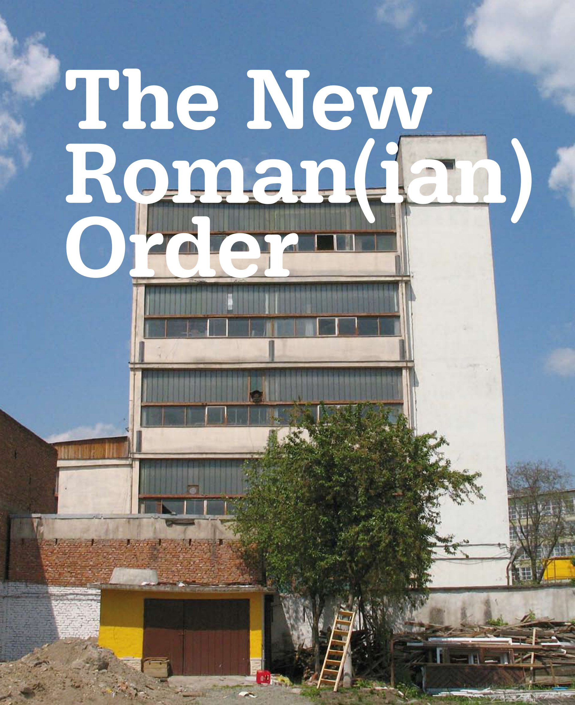
FROM TOP: COURTESY PLAN B, CLUJ AND BERLIN; JOHUA WHITE; COURTESY THE ARTIST AND BLUM & POE, LOS ANGELES; GLAUSTONE GALLERY, NEW YORK; AND JOHNEN GALLERY, BERLIN. OPPOSITE: COURTESY PLAN B.