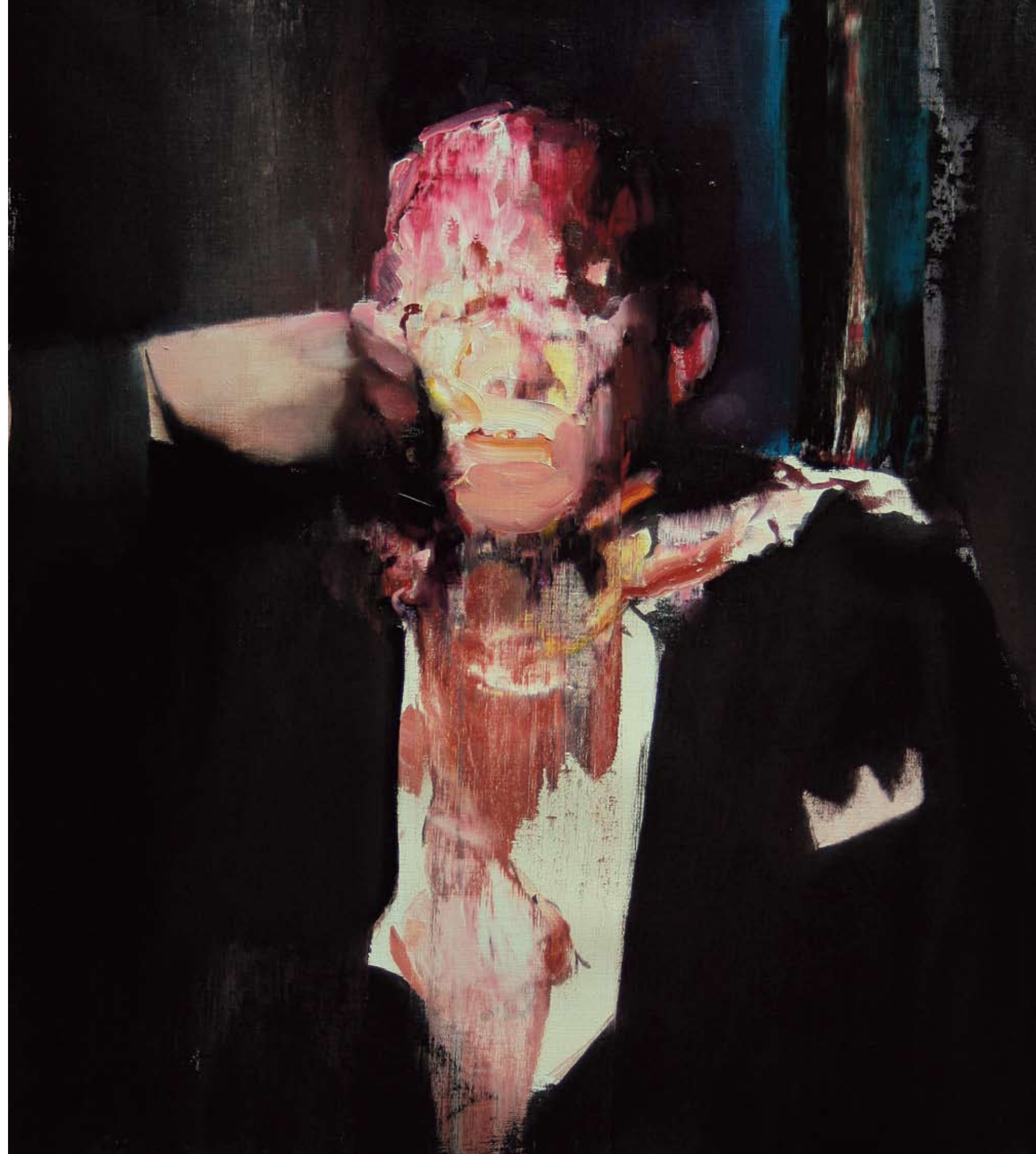
Adrian Ghenie, Pie Fight Study 4 , 2008. Oil on canvas, 27 1/2 x 23 1/2 in.

Plan B has earned a reputation for the collaborative way with which it engages with artists. Last year, in keeping with his original intentions for Plan B to facilitate projects, Pop invited Cantor to use the gallery as a workshop in preparation for his solo show, "The Need for Uncertainty," which toured three U.K. museums. Pop also served as commissioner of the Romanian Pavilion at the Venice Biennale in 2007, and in October, Plan B will participate in the Frieze Art Fair. The gallery's good reputation—coupled with the fact that its artists' works have become extremely desirable to international collectors—enabled Pop to open a second space in Berlin last year with cofounder Mihaela Lutea. And next month, their Cluj gallery will move into a larger space, a former paintbrush factory that has recently been renovated to house artists' studios and gallery spaces. Their neighbors will include