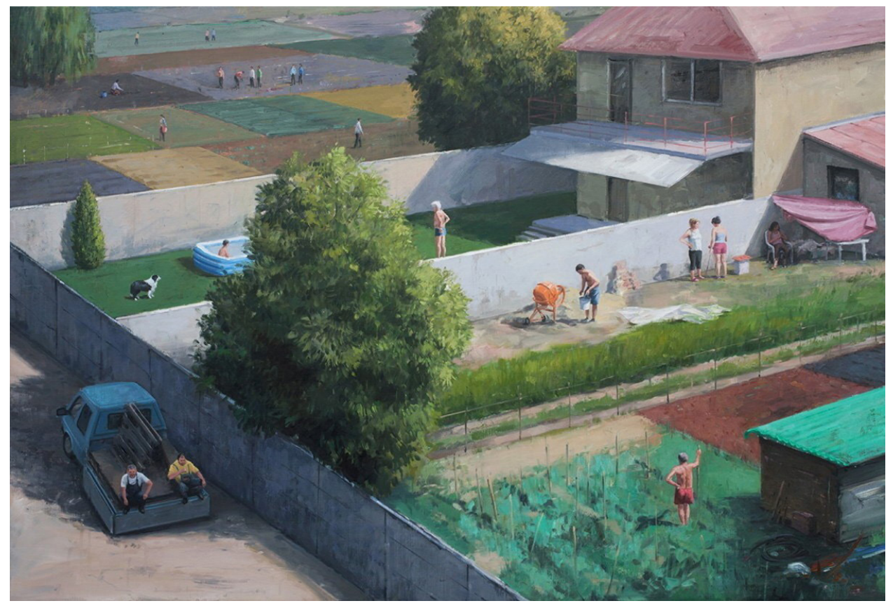
'Pursuing their goals' (2014) by Şerban Savu

The communist regime which collapsed in the bloody revolution of 1989 looms large for Savu and Mureşan, who became adults in the chaotic decade immediately afterwards. Communism promoted itself through mosaics glorifying workers and flattering portraits of Ceauşescu, the "Genius of the Carpathians", but stifled artistic expression. In private circles, "abstract art was considered real art, free art, [and] abstract painting meant you were painting against the regime," says Mureşan. "You couldn't exhibit, but you could show it to your friends," so it didn't count as real dissent. The most defiant act, if it can be regarded as such, was when Ion Grigorescu, commissioned to paint a portrait of Ceauşescu, turned in an "expressive" rendition which couldn't be exhibited for fear of offending the vain autocrat.