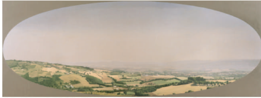
Aria Umbra II, 2007 - 09, oil on linen, 93 x 250.5 cm. Collection: National Gallery of Canada, Ottawa, Canada Jerusalem, Israel.

It must be very exciting to be the founder of the Jerusalem Studio School, and to feel that you are taking part in the creation of a new set of artistic traditions in what is a relatively young country.