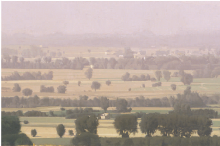
DETAIL: Aria Umbra I, 2003 - 2004, oil on linen, 119 x 250.5 cm. Collection: Israel Museum.