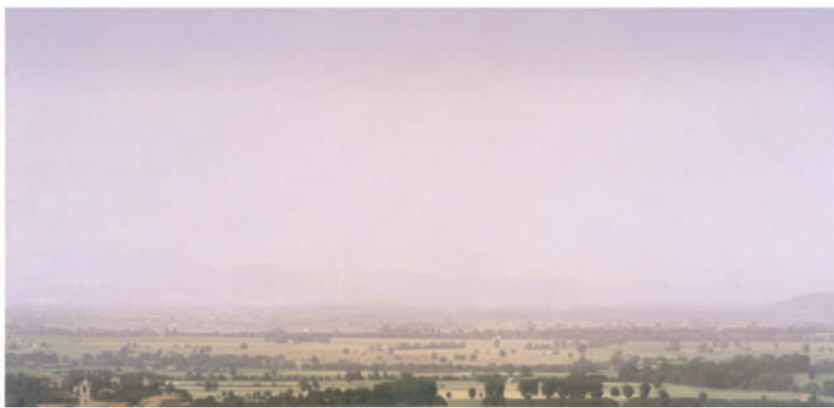
Aria Umbra I, 2003 - 2004, oil on linen, 119 x 250.5 cm. Collection: Israel Museum.

When I am painting a landscape, it's not the nature which captivates me. When looking at a landscape I consider it just as I would any other motif; it's seen through an imposed particularized lens, an accumulated corpus of painterly pictorial desires I have amassed, like the amassing of barnacles on an old ship's hull, it becomes an archetype and one with its own ecosystem. One of the reasons I am seduced by the Italian landscape is that it's impossible for me to consider it outside that historical lens of painting, whether imagined or empiric. Seeing the concrete as such becomes canonical, and painting, fertile, pregnant and full of potential.