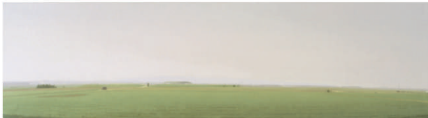
Tel Kakun, 2005 - 2007 oil on linen, 68.6 x 250.5 cm. Private Collection.

That said, I am very concerned with maintaining what I think of as the plein air impulse: the stuff I try to nail down in the smaller preparatory works I start on site before embarking on the large pieces and precisely because I do covet the incidental, empiric, the random as important values.