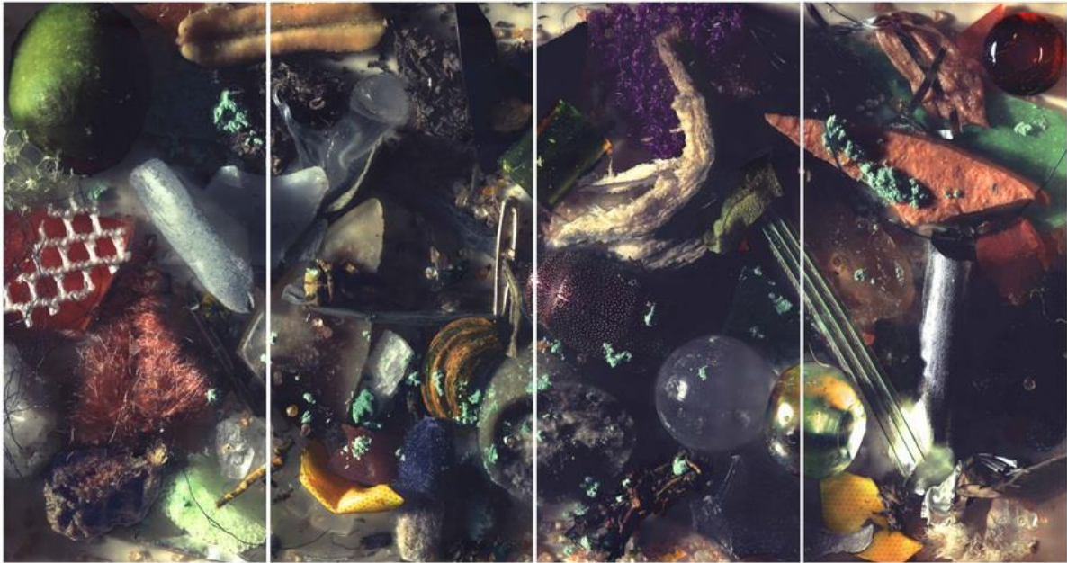
RAN ZHANG , Natritine Gaze (part 1-4) , 2014–15, synthetic and organic materials 100-times magnified, inkjet print, four color silkscreen print, acrylic, watercolor, pigment and ink on paper, 120 × 56 cm (each), 120 × 224 cm.

With a focus on magnified organic matter, the solo exhibition “Enantiomers and traces” by Rotterdam-based artist Ran Zhang, at Galeria Plan B’s central Berlin outpost, involuntarily banked on the presently heightened awareness of atomic-level processes. Titled after the property of molecules forming mirror images of each other—enantiomers—the small gallery show was a deep dive into Ran’s artistic endeavor of object magnification and the creation of seemingly authentic digital image duplicates.