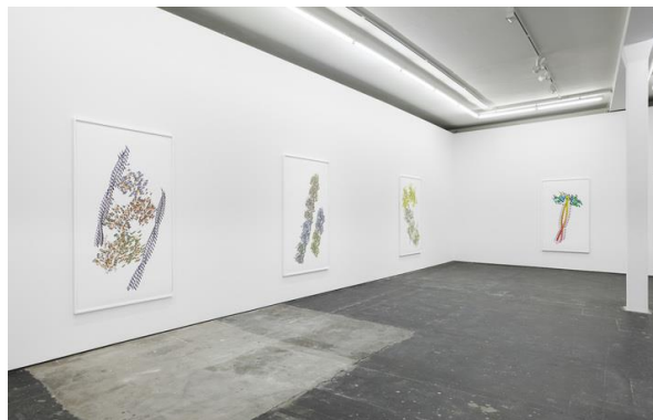
Installation view of RAN ZHANG ’s “Enantiomers and traces,” at Plan B, Berlin, 2020.

Upon entering the gallery, visitors found themselves in front of Natritine Gaze (part 1-4) (2014–15), a four-piece print presenting an accumulation of enlarged organic and synthetic substances. On the framed silkscreens, mundane items such as pinheads, dust balls, or rubber bands are enhanced 100-fold under a microscopic camera. Ran’s image augmentation turns the method of magnifying on its head. Instead of elucidating each object’s surface, her close-up photographs unexpectedly bare completely new material topographies, where items’ textures dissolve into a bizarre, primeval landscape made up of glass, powder, and fibrous mountain ranges.