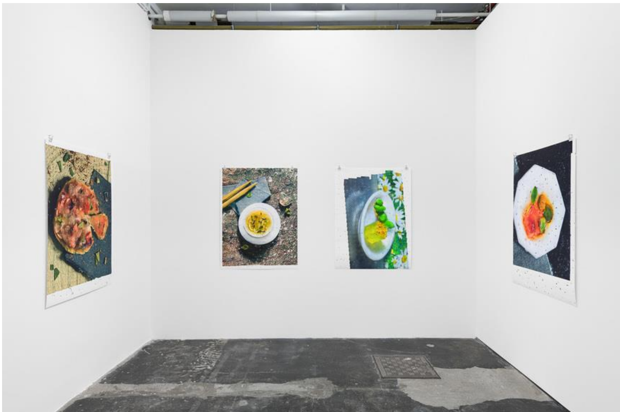
Installation view of RAN ZHANG 's "Enantiomers and traces," at Plan B, Berlin, 2020.

For the amateur, peering through a microscope is often accompanied by an excitement for the unfamiliar—looking through the lens to find a shape enlarged, the imperceptible rendered visible and thus fathomable to the human mind. Ironically, in the current global pandemic, both viral fear and salvation lie within the microscopic realm. Rather than excitement, unfamiliar biological microcosms are now shadowed by anxiety and ambivalence, feelings hardly alleviated by the ubiquitous warnings of an invisibly transmitted virus.